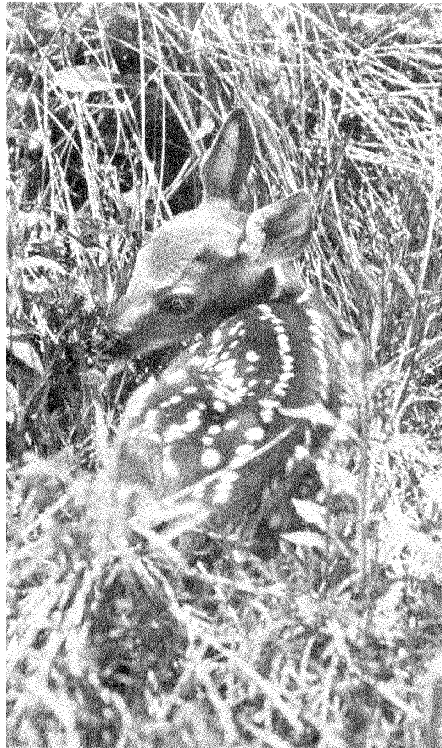
A Young White-tailed Resident

The WNYNSC lies within the northern deciduous forest biome, and the diversity of its vegetation is typical of the region. Equally divided between forest and open land, the site provides a habitat especially attractive to white-tailed deer and various indigenous birds, reptiles, and small mammals. No species on the federal endangered-species list are known to be present on the WNYNSC.